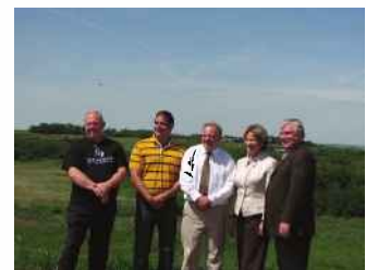
Waterline announcement held at Diefenbaker Lake.